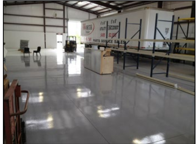
Ideally suited as a solid color floor coating where fast return to service is paramount