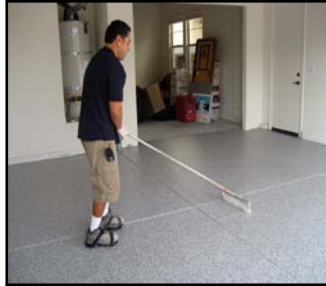
Used as a 1 coat high build sealer over a Flaked Garage Floor