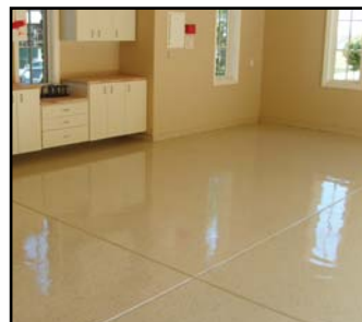
Extreme high gloss provides a mirror like finish