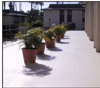
Applied over a mezzanine area