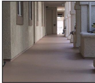
Applied over a textured walkway