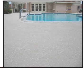
Applied over a knockdown pool deck